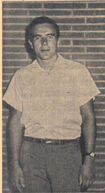
Swiss Yodeler Pauses Between Songs